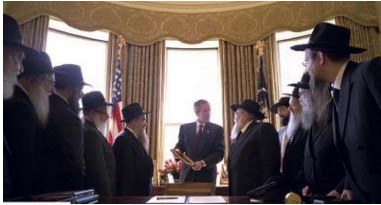
President George W. Bush (2001-T.S.E.C)